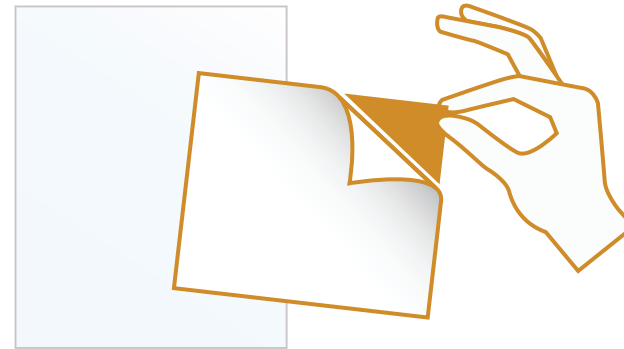
Install & Transparency Diagram

Defy wallcovering transforms walls into dry erase boards.